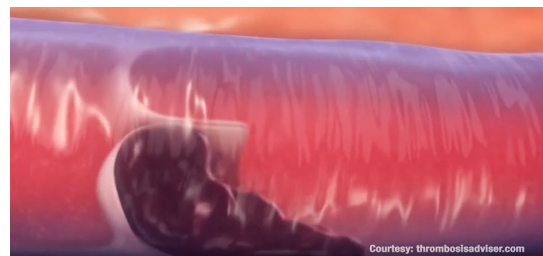
Venous Thromboembolism (VTE)